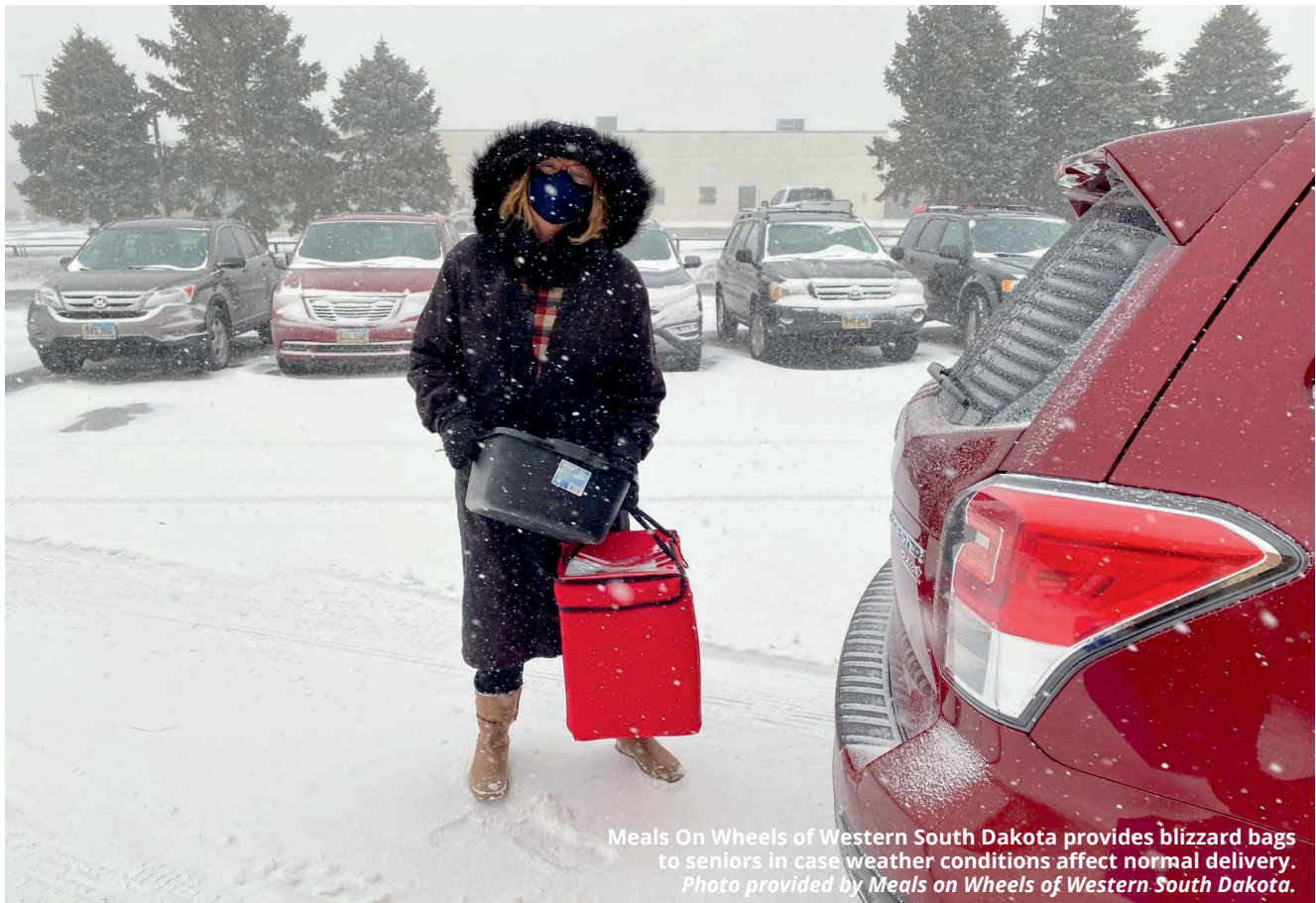
Meals On Wheels of Western South Dakota provides blizzard bags to seniors in case weather conditions affect normal delivery.

Anyone interested in getting service or helping with the cause can contact Meals on Wheels of Western South Dakota at (605) 394-6002.