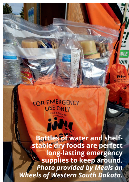
Bottles of water and shelf-stable dry foods are perfect long-lasting emergency supplies to keep around.

"It's also advisable to check your tires for proper inflation and tread, and make sure your windshield wipers are in good condition with freeze-resistant washer fluid," Reiners added.