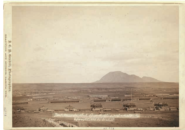
Right: A photograph of Fort Meade with Bear Butte in the distance.

Lamont ordered that the Star Spangled Banner be played during evening retreats across the nation.