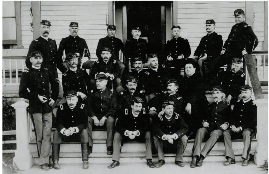
Above: Officers of the 8th Cavalry in Fort Meade, S.D. in 1892.