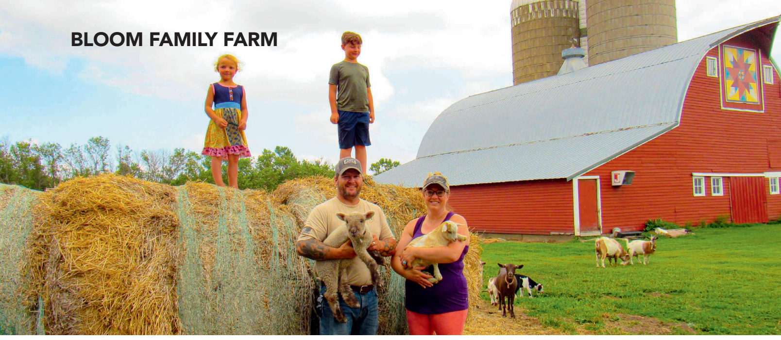
The move from town to farm has gone well for the Bloom Family.