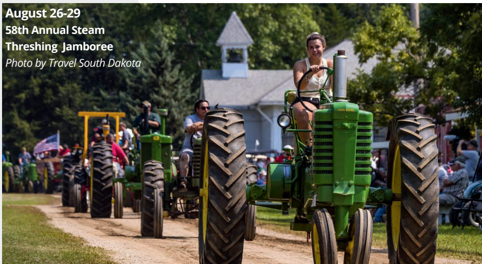
August 26-29 58th Annual Steam Threshing Jamboree

To have your event listed on this page, send complete information, including date, event, place and contact to your local electric cooperative. Include your name, address and daytime telephone number. Information must be submitted at least eight weeks prior to your event. Please call ahead to confirm date, time and location of event.